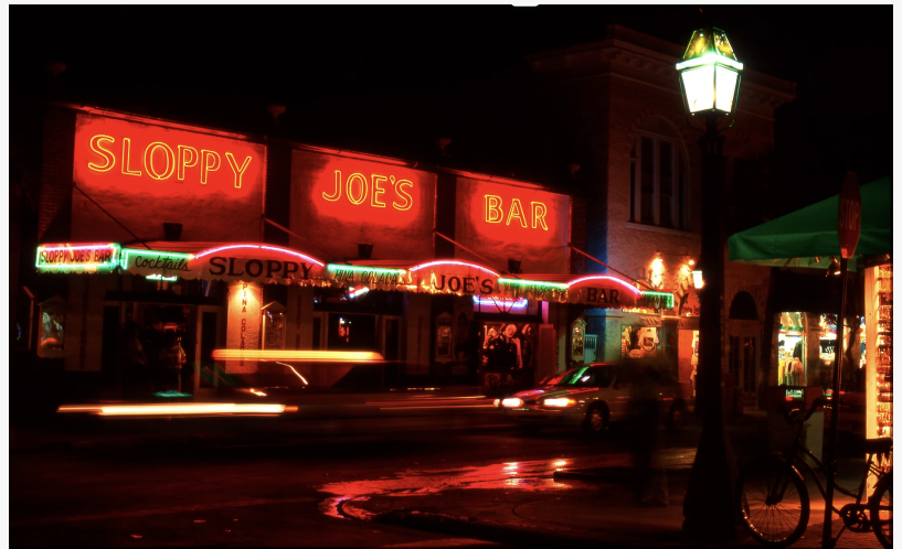
Sloppy Joe's Haunted Bar

KEY WEST, FLORIDA, USA, November 12, 2021 /EINPresswire.com/ -- If you are looking to do a ghost tour in Key West but don't like big groups or have limited flexibility, then this is the tour for you. Discover the ghosts of Key West on your own schedule. Pause the tour anytime, grab a drink and get your party on, then start again when you're ready to hear the next ghost story.