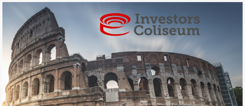
Bridging The Communication Gap

exploration company focused on advancing its Fortuna Project located in Ecuador, is the latest company to join www.theinvestorscoliseum.com .