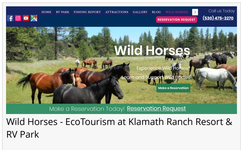
Wild Horses - EcoTourism at Klamath Ranch Resort & RV Park

HORNBROOK, CALIFORNIA, UNITED STATES, November 16, 2021 /EINPresswire.com/ -- Klamath Ranch Resort in Hornbrook California is pleased to be able to offer a rare year-round wild horse experience and viewing opportunity to our guests.*