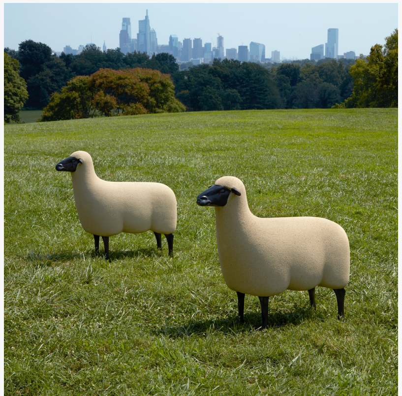
François-Xavier Lalanne (French, 1927-2008) Two Moutons de Pierre

https://www.bidsquare.com/online-auctions/freemans/cha-m-soutine-french-russian-1893-1943-le-viaduc-rouge-pr-s-de-vence-2486255