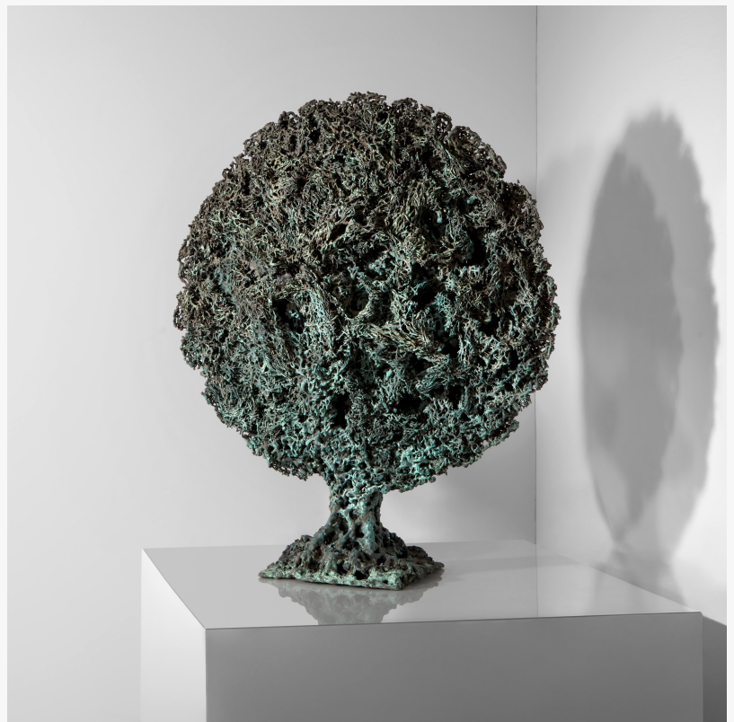
Harry Bertoia (American, 1915-1978) Untitled (Study for Fiery Circle)