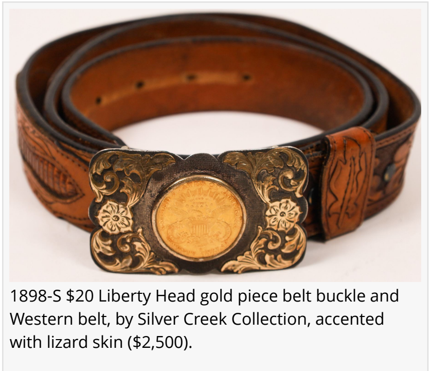
1898-S $20 Liberty Head gold piece belt buckle and Western belt, by Silver Creek Collection, accented with lizard skin ($2,500).

Also sold on Day 5 was a collection of over 100 vintage postcards from the Trinity County (Calif.) town of Weaverville, from the 1940s-1950s and older, many of the Chinese Joss House ($1,000); and a group of five wooden tokens for the Pike Woolen Co., tailors (Oakland, Calif.), the obverse showing a Childs Indian Head and stars, the obverse "Pike Woolen Co." ($938).