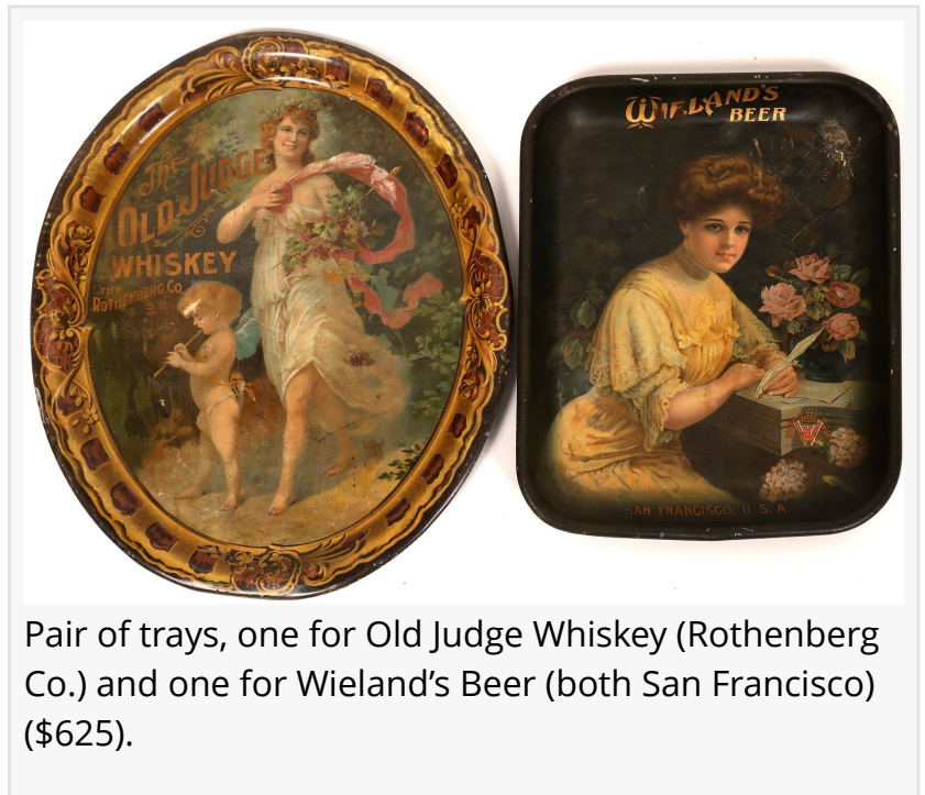
Pair of trays, one for Old Judge Whiskey (Rothenberg Co.) and one for Wieland's Beer (both San Francisco) ($625).

Day 1, on Thursday, October 28th, featured General Americana, led by Alaska and Wyoming collectibles and Part 1 of the MacKenzie Montana collection; bottles, saloon and cigar items; marbles and toys. Sold that day was a nearly complete pair of 1920s-era Levi jeans, found in the Empire Mine at Tombstone, Arizona, next to the Toughnut Mine. The jeans gaveled for $625.