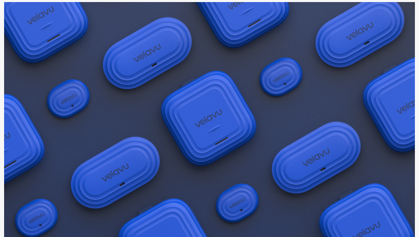
Velavu suite of devices

Each year, the CES Innovation Awards program selects winners across 27 product categories based on innovation, engineering and functionality, aesthetic and design, reviewed by an elite panel of industry expert judges, including members of the media, designers, engineers, and more. This year the awards program received a record number of submissions.