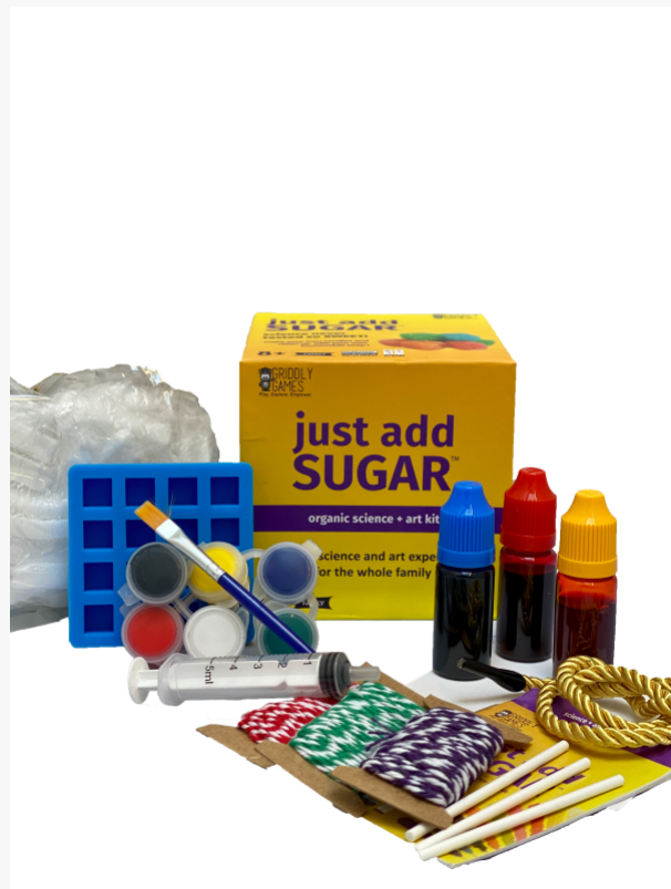
Just Add Sugar from Griddly Games