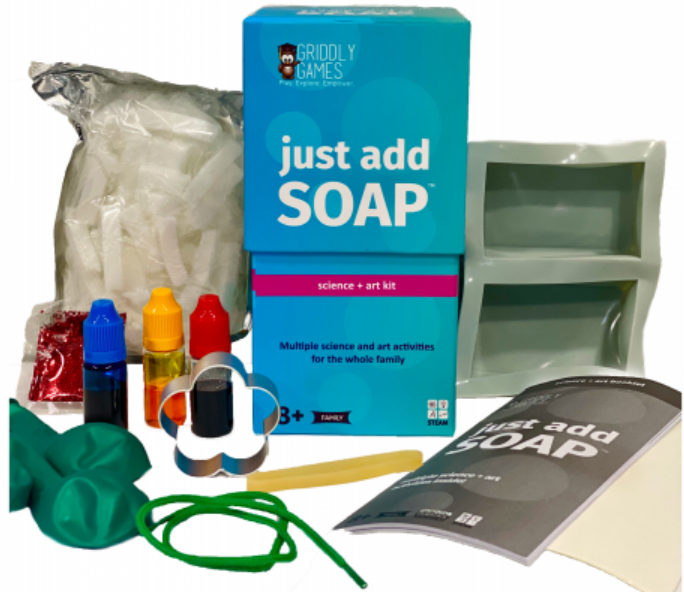
Just Add Soap (contents) from Griddly Games