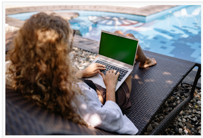
Working next to your villa pool is a remote work positive.

Long-term rentals are also a popular choice for families considering a move overseas, as they provide a chance to 'test the water' before taking the plunge and buying a home. Data from