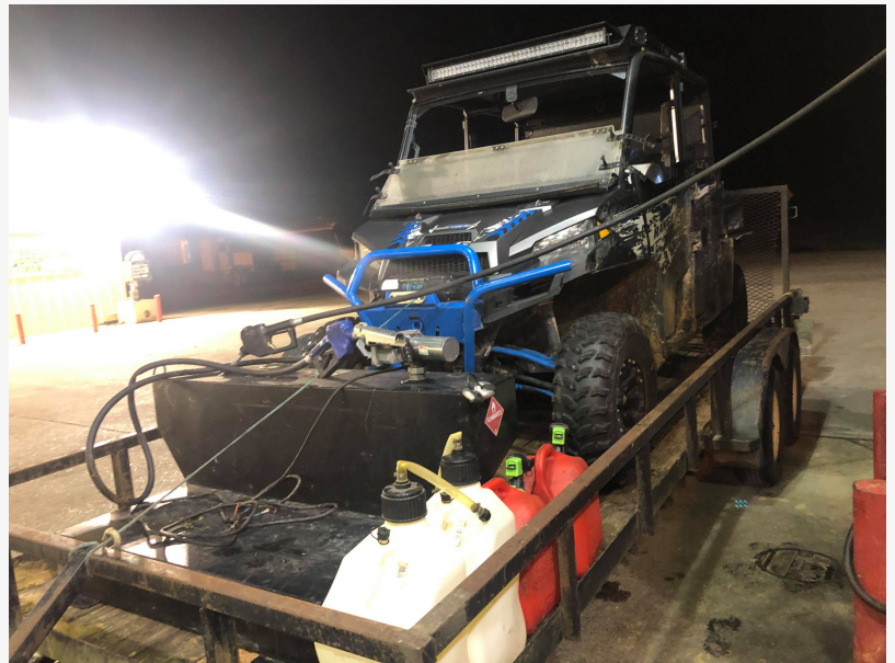
Pinnacle Search and Rescue (Cajun Navy 2016) UTV Staged in Preparation for Hurricane IDA's Landfall

The Albertsons Companies Foundation encourages individuals and companies to support their organization. You can help by donating on their website and learning more about the foundation at http://national.albertsonscorporationfoundation.org/about-us/ .