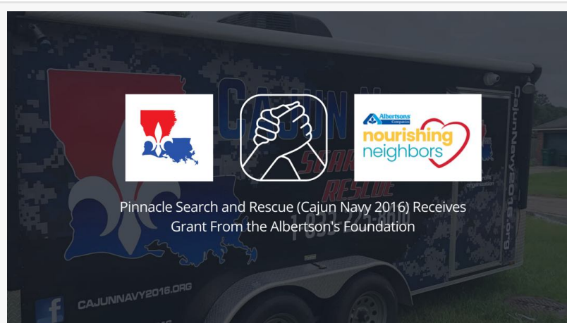
Pinnacle Search and Rescue (Cajun Navy 2016) Receives Grant From the Albertson's Foundation

Pinnacle Search and Rescue (Cajun Navy 2016) plans to have the trailer wrapped with their logo, as well as the Albertson's Foundation logo.