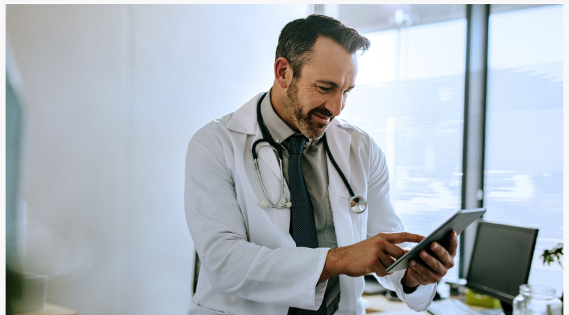
Doctor speaking with a patient about changes in their RPM readings