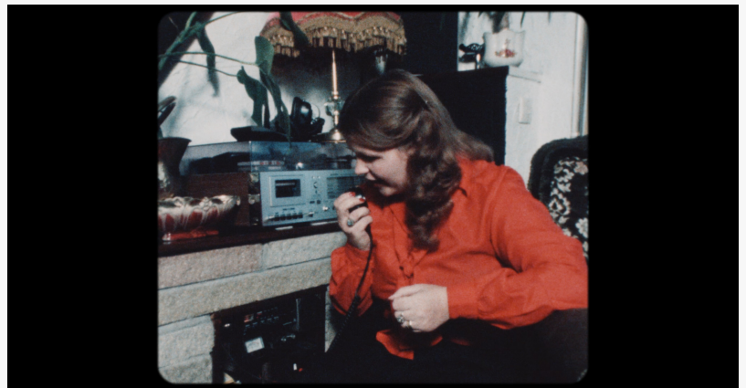
Life in Air