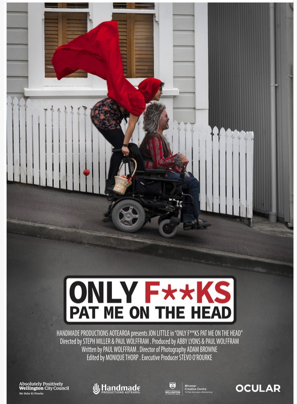
Only F$$ks Pat me on the Head