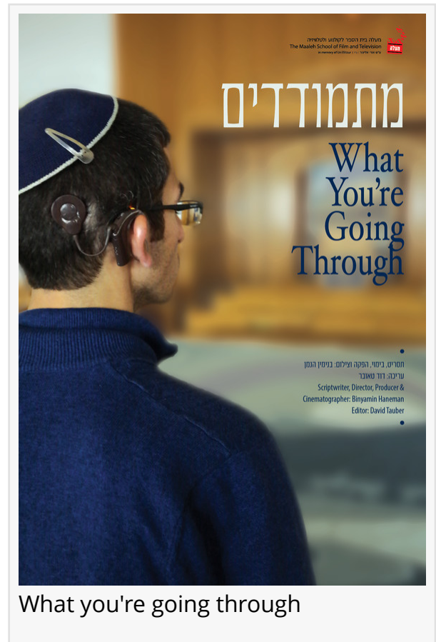
What you're going through

Those who are interested in attending the NYC Short Documentary Film festival may purchase tickets online here .