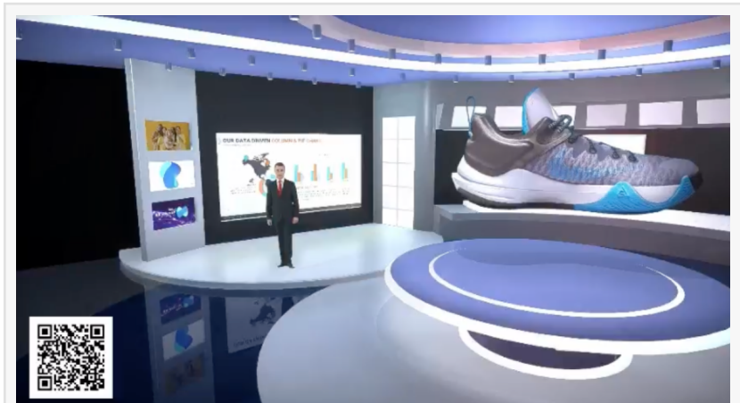
Metaverse Event 3D Nike Sneaker

MENLO PARK, CALIFORNIA, USA, November 18, 2021 / EINPresswire.com/ -- Nextech AR Solutions Corp. ("Nextech" or the "Company") (OTCQB: NEXCF) (NEO: NTAR) (CSE: NTAR) (FSE: N29), a Metaverse Company and leading provider of augmented reality ("AR") experience technologies and services is pleased to announce the integration of Nextech's redesigned virtual events platform, now rebranded as "ARitize Events 3D". With this integration, immersive virtual events are now available as part of its growing suite of metaverse solutions. "ARitize Events 3D" is now able to showcase 3D products seamlessly with its existing suite of Augmented Reality solutions, creating a first of its kind metaverse event platform.