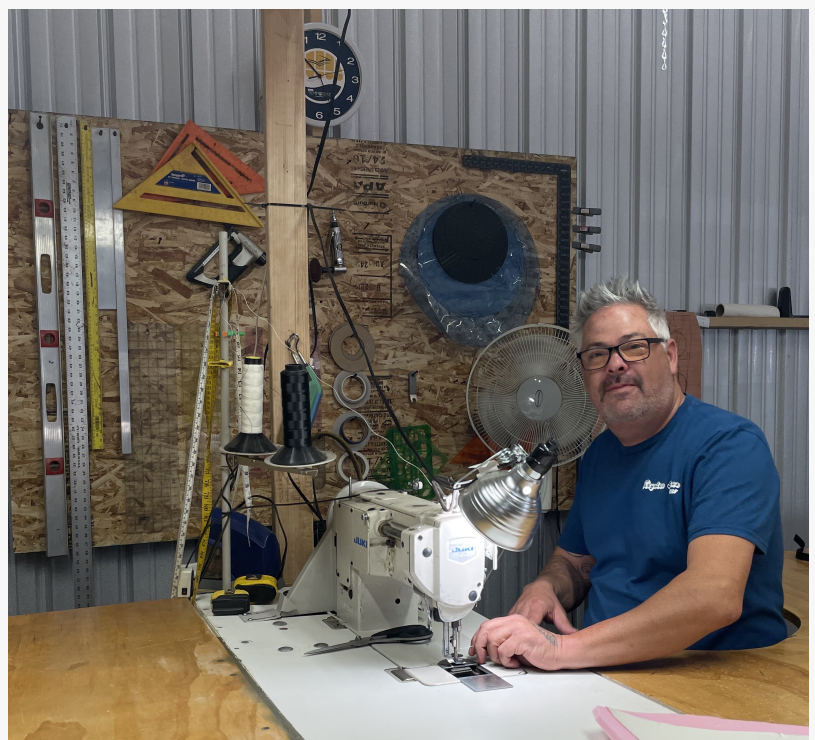
Fine Line Canvas’ most sought after service centers on high end marine canvas and upholstery work.