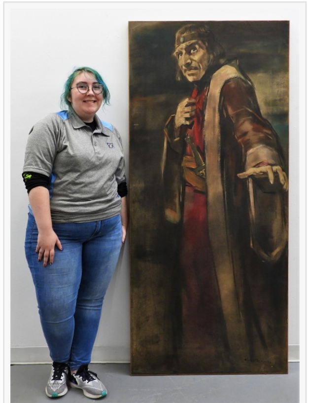
Mixed media portrait painting mounted to canvas, signed by Han Van Meegeren (Netherlands, 1889-1947), impressive at 73 inches by 33 inches ($5,938).