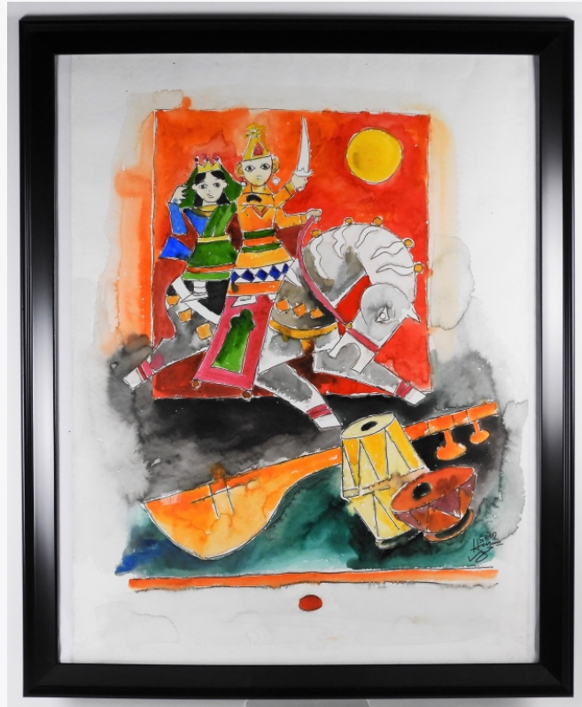
Cubist figural watercolor painting by Maqbool Fida Husain (India, 1915-2011), depicting a man and a woman on the back of a white horse ($10,625).

A mixed media portrait painting mounted to canvas, signed by Han Van Meegeren (Netherlands, 1889-1947), depicting a man in a