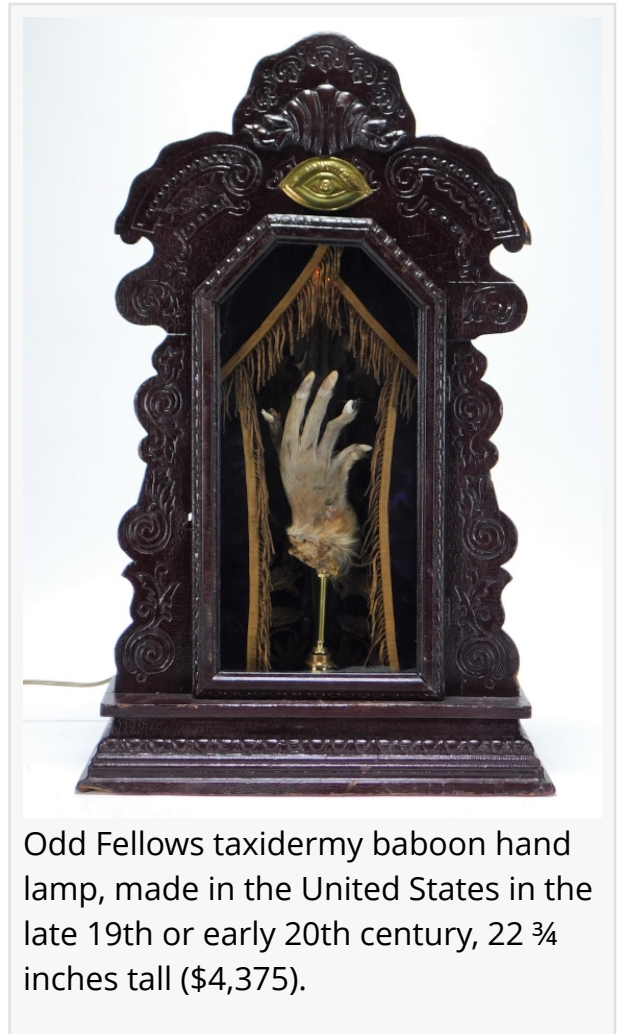
Odd Fellows taxidermy baboon hand lamp, made in the United States in the late 19th or early 20th century, 22 \frac{3}{4} inches tall ($4,375).

An Odd Fellows taxidermy baboon hand lamp, made in the United States in the late 19th or early 20th century, 22 \frac{3}{4} inches tall, changed hands for $4,375 (blowing past its $250-$400 estimate). The taxidermy baboon hand was surrounded by deep purple velvet inside a clock case decorated with acanthus leaves and a brass eye. The Odd Fellows was a non-political, non-sectarian fraternal order founded in 1819 in Baltimore by Thomas Wildey.