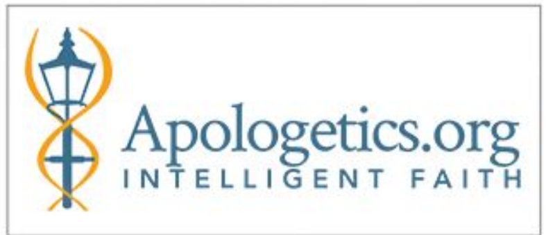
C.S. Lewis Society