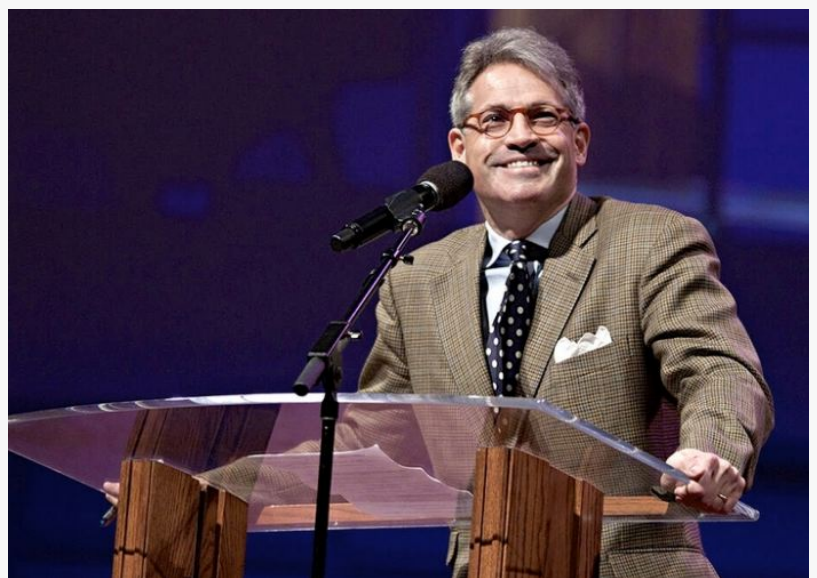
Best-selling author Eric Metaxas is coming to Florida in January 2022