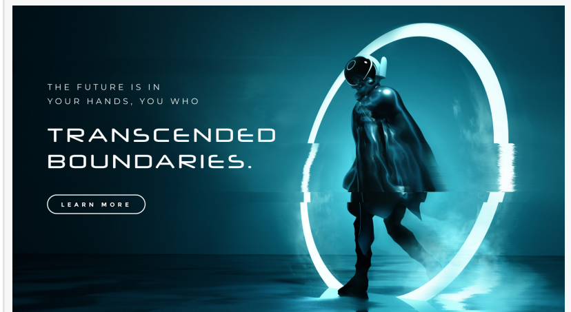
2022 Vega Digital Awards: Transcending Boundaries