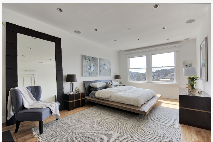
Coveted Telegraph Hill location with quick access to FIDI

Emily Roberts Concierge Auctions +1 212-202-2940 email us here