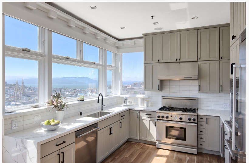
Chic owner's penthouse plus four income residences