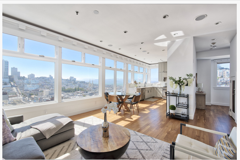
Two stunning rooftop terraces for outdoor entertaining

The Telegraph Hill Penthouse, located at 10 Reno Place, is available for showings daily 1-4PM and by appointment and for private virtual showings. As part of Concierge Auctions' Key for Key® giving program in partnership with Giveback Homes, the closing will result in a new home built