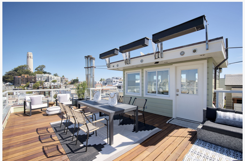
270-degree views of San Francisco's skyline and the Bay