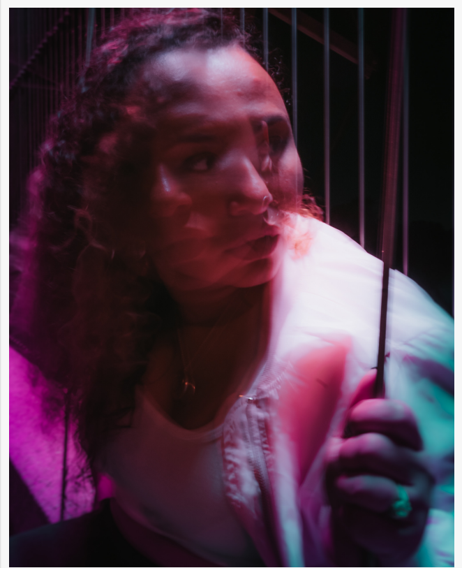
Beauty in theRiot 2021 promo shoot

This press release can be viewed online at: https://www.einpresswire.com/article/556685618