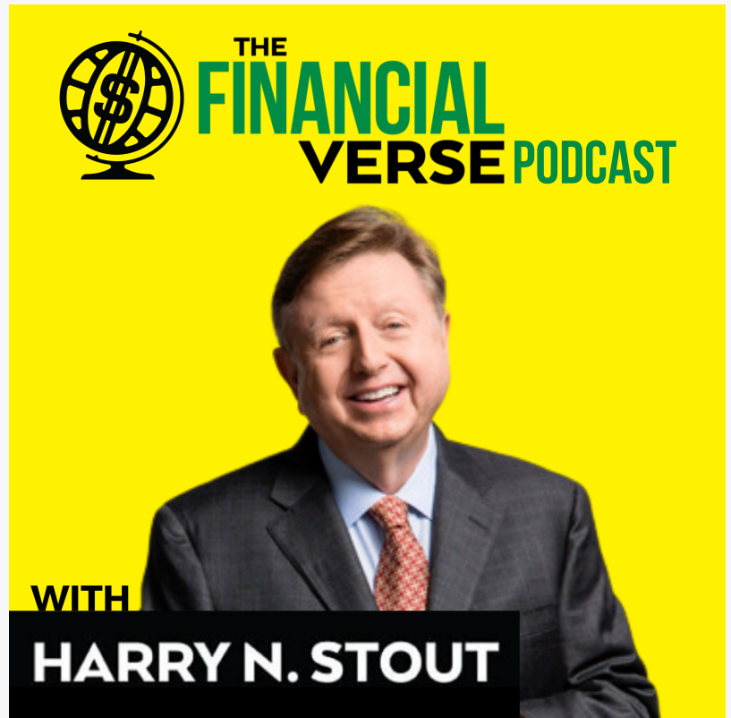
The FinancialVerse Podcast