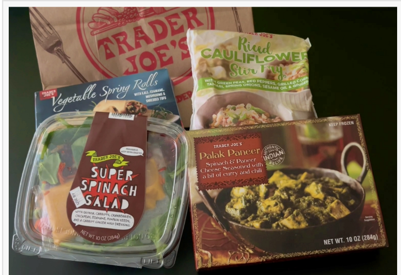
These are some of the popular Trader Joe's products that contain large amounts of lead

One of these foods, Trader Joe's Super Spinach Salad, has more than 50 times the allowable limit — in a single serving.