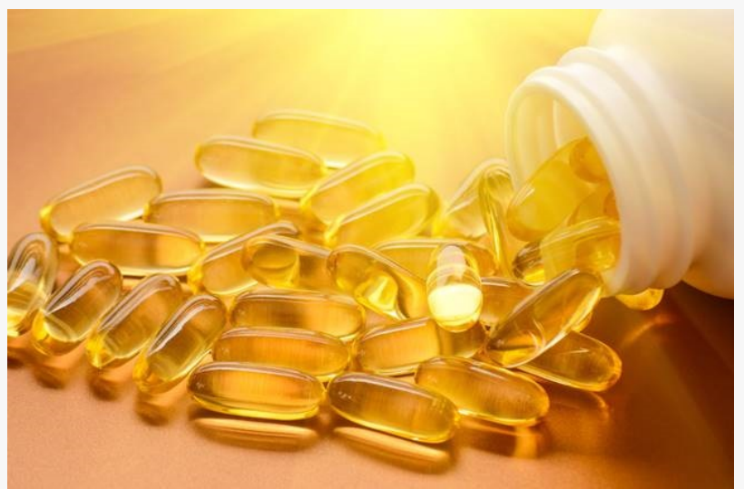
Vitamins D and K2

WASHINGTON, DC, USA, November 19, 2021 /EINPresswire.com/ -- As we enter cold and flu season and see a rise nationally in COVID 19 infections, the best-selling book, Simplifying The COVID Puzzle , uses science based evidence in a goal to help de-politicize the COVID 19 debate and offer up tools for overall health by exploring in-depth benefits of immunity boosting of the human body.