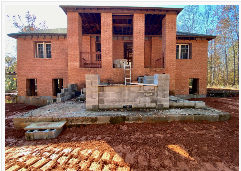
26443 Indian Trace, Unionville, VA 22567 □ 4 BR/5 BA partially completed brick home on 10.02 +/- acres

Nicholls Auction Marketing Group, Inc., is a professional accelerated marketing firm specializing in the promotion and sale of real estate via the auction method of marketing. Headquartered in Fredericksburg, VA, NAMG has been serving the needs of the Mid-Atlantic region since 1968. The Nicholls team comprises world and state champion auctioneers, an award winning marketing staff, and sales percentages unmatched in the industry. For more information about Nicholls Auction Marketing Group, Inc., visit www.nichollsauction.com or call 540-898-0971.