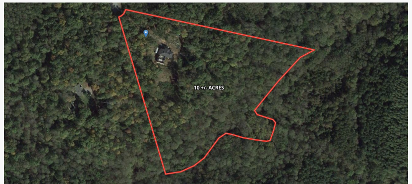
26443 Indian Trace, Unionville, VA 22567 □ 4 BR/5 BA partially completed brick home on 10.02 +/- acres