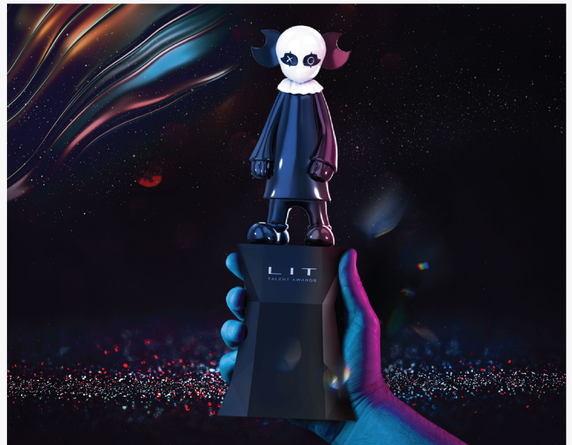
LIT Awards Statuette