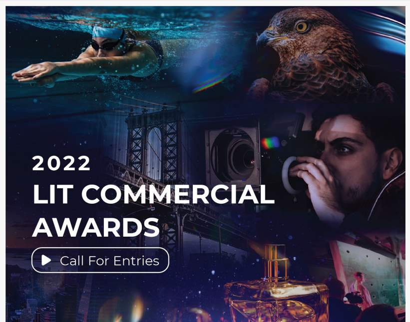
2022 LIT Commercial Awards: Calling for Entries

The LIT Commercial Awards caters to all production companies, advertising and public relations firms, agencies, production crews, and independent producers whom created impactful and resonating commercial projects, from both local and international. They are all invited to showcase their best commercial video