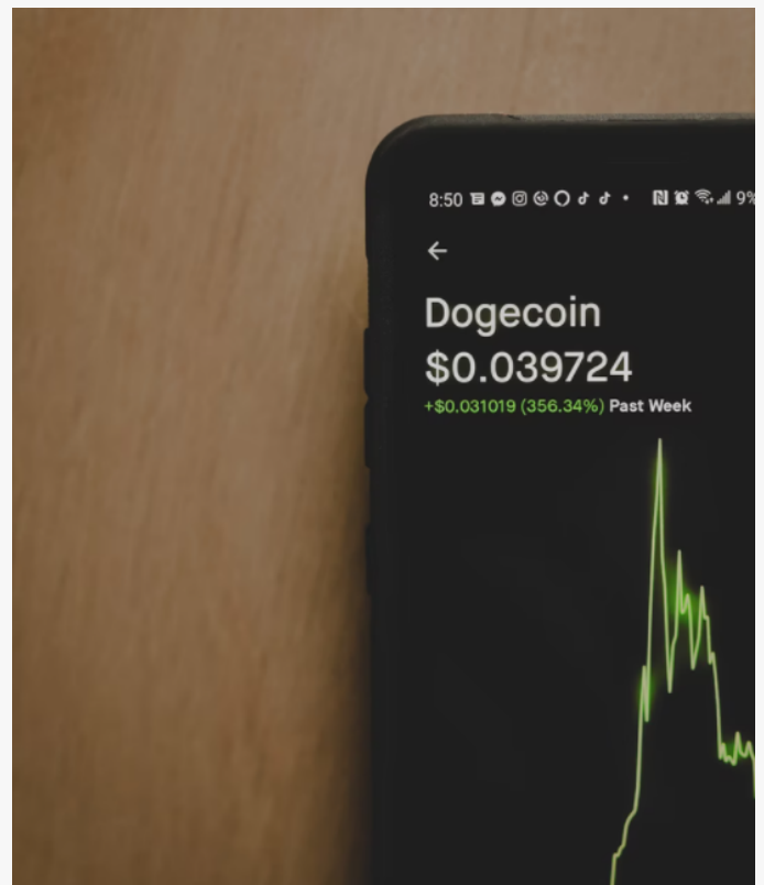
Real Estate Investing with Blockchain