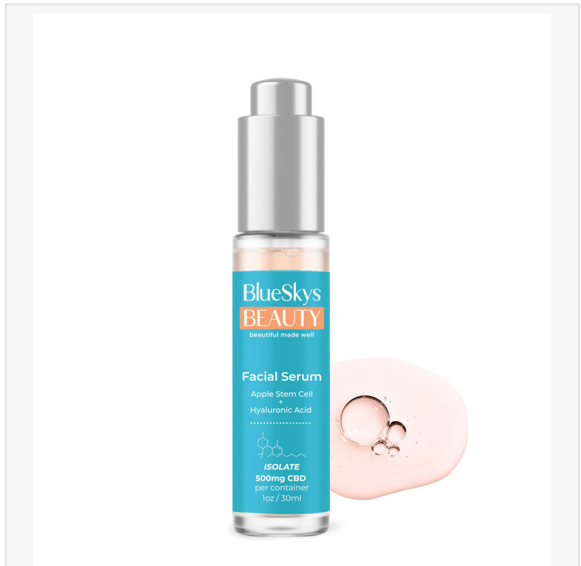
BlueSkys Beauty Facial Serum

“Having been involved in all aspects of bringing this new brand to life, from the formulary decisions, personally using and testing the products on my own face and body to the packaging