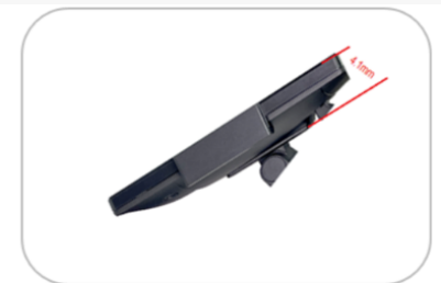
4.1mm slim design