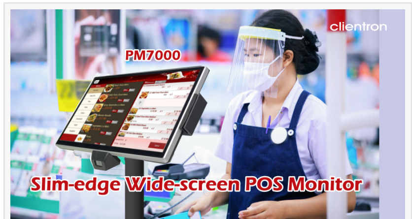
the Newly Slim-edge Wide-screen POS Monitor

Optional MSR, iButton, fingerprint, 2D scanner, and RFID