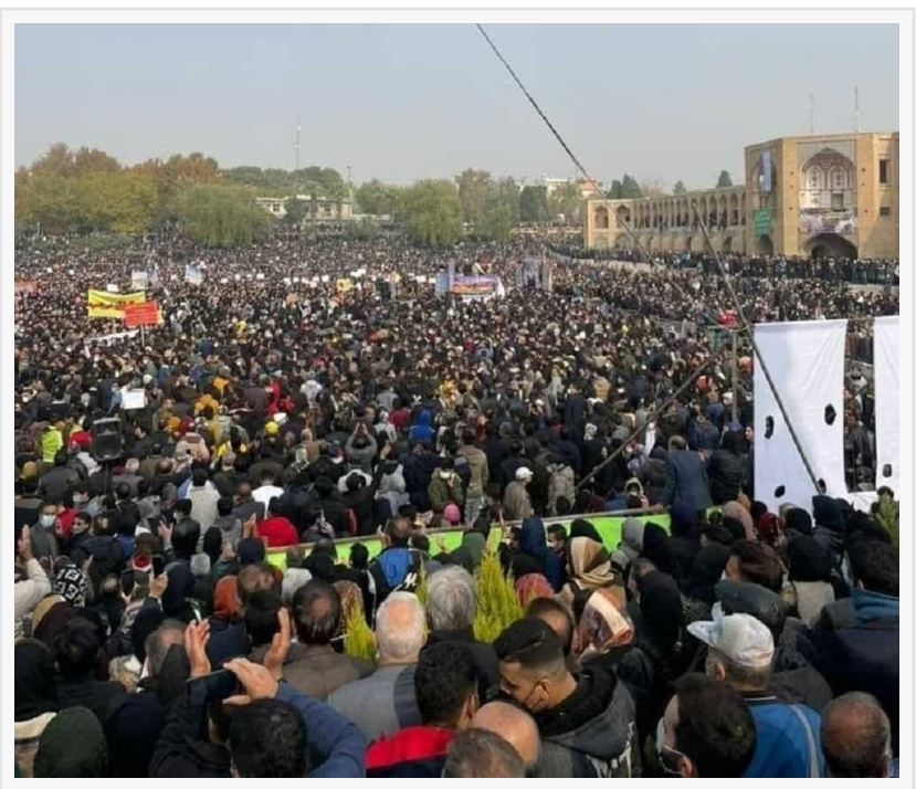
(PMOI / MEK Iran) and (NCRI): Fearing the spread of the uprising to other parts of Iran, the clerical regime intends to disrupt the spread of news and pictures of this massive gathering by disrupting and cutting off the Internet.

Today, inflation, poverty, unemployment, and other economic problems have brought Iran's population is on the verge of another explosive uprising. And the powder-keg society is just waiting for a spark.