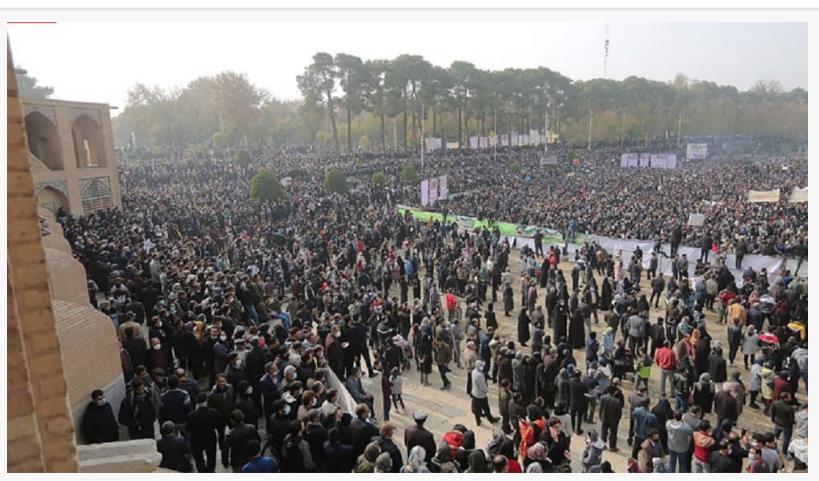
(PMOI / MEK Iran) and (NCRI): a large area of the Zayandeh Rud Riverbed. Protesters are chanting: "Guns Tanks (are useless), Mullahs must get lost," "Neither Gaza nor Lebanon, my life only for Iran,"