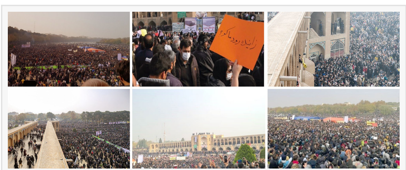
(PMOI / MEK Iran) and (NCRI): On Friday, the twelfth day of a sit-in by farmers in Isfahan, tens of thousands demonstrated in support of farmers for water shortages and the clerical regime's predatory policies that have dried up the Zayandeh Rud River.

On Friday, the 12th day of a sit-in by impoverished farmers in Isfahan, tens of thousands of people demonstrated in support of the farmers' protest