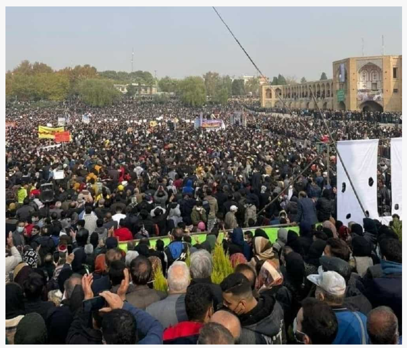
(PMOI / MEK Iran) and (NCRI): Friday's demonstration was so crowded that the regime's state-run media, 30,000 which usually censors news of protests, admitted that more than 30,000 people of Isfahan province had gathered at Zayandeh Rud.

joined the farmers in their cries for justice and basic rights. Zayandeh Rud, which is the largest river in central Iran, has become a rallying point for people who are fed up with more than four decades of tyranny and corruption under the rule of the mullahs.