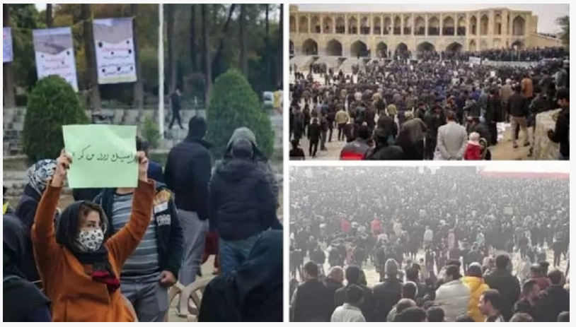
(PMOI / MEK Iran) and (NCRI): the country's resources and infrastructure have brought the country's agriculture industry to a point where it can no longer address the problems of Isfahan's farmers.

Farming is among the key economic activities of Isfahan, and with irrigation water becoming scarcer, the