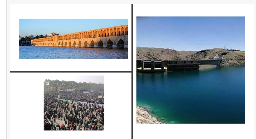
(PMOI / MEK Iran) and (NCRI): Experts on Isfahan's water resources, 86 percent of the water store behind the Zayandeh Rud dam is empty, and if the remaining 14 percent is released, it will provide no more than a few days' worths of water for the river.

livelihoods of millions of people in the province are endangered.