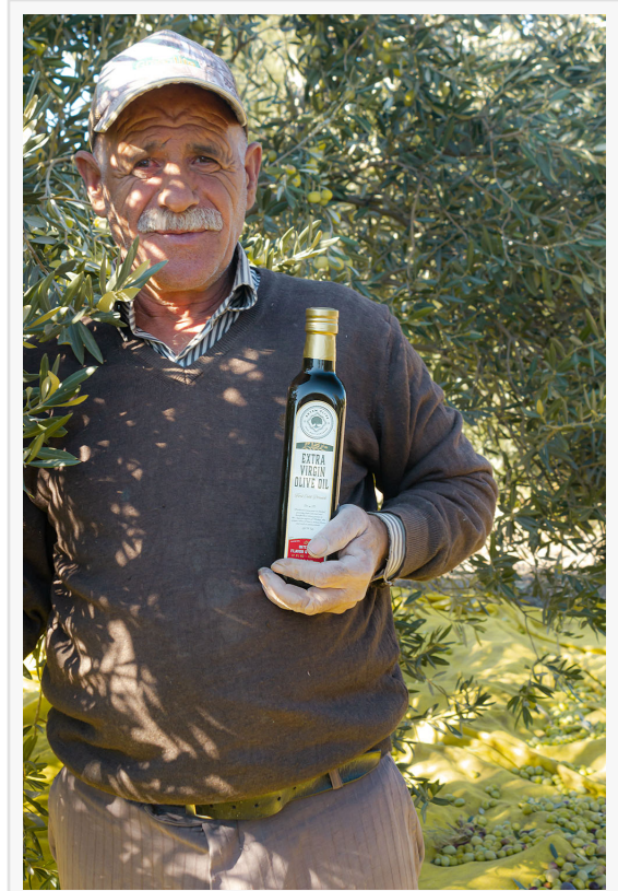
A farmer of Artem Oliva is holding the first cold pressed Extra Virgin Olive Oils of Artem Oliva