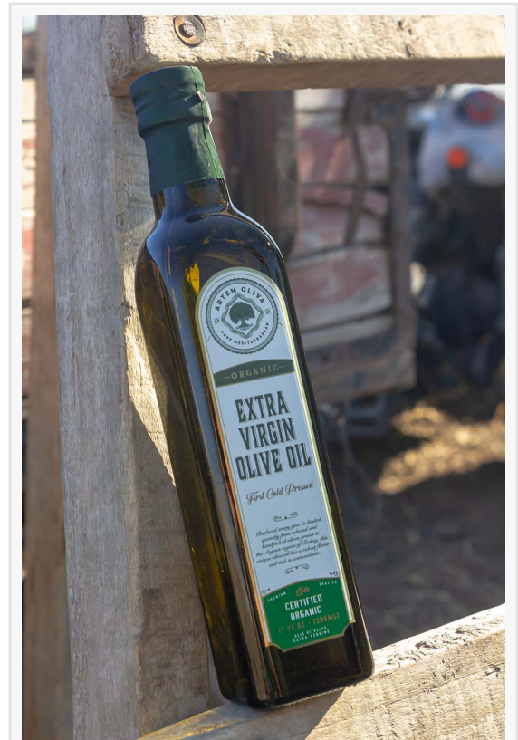
Artem Oliva produces high quality and certified Organic Extra Virgin Olive Oil

As the best olive oil brand in Turkey , Artem Oliva, covers a great portion of its manufacturing and exporting under Artem Oliva that is registered under Turkish trademark registry. With this opportunity, such activities are contributing the industry's development in Turkey heavily and adding value to customers from other countries who are looking for reliable and high-quality olive oil from Mediterranean region.