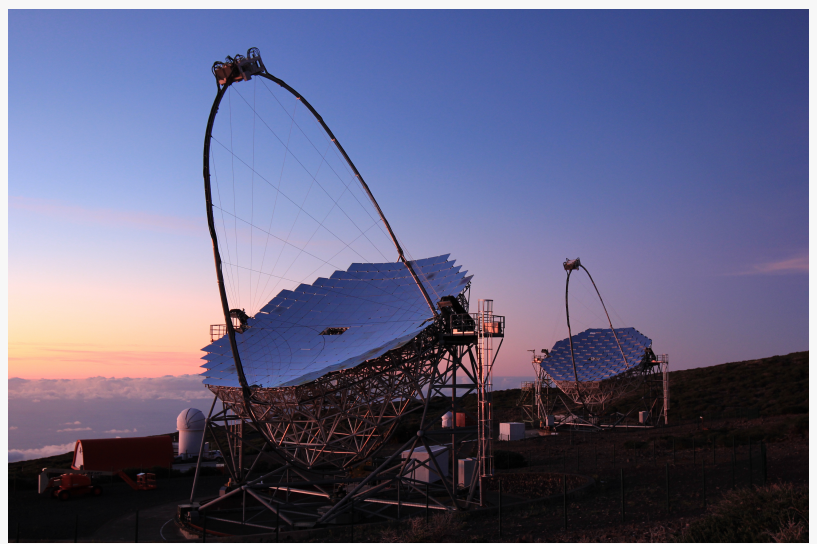
MAGIC (Major Atmospheric Gamma-Ray Imaging Cherenkov) are the world's largest air-Cherenkov-telescopes each with a diameter of 17m

"The other important factor in choosing Spectrum digitizer cards is their excellent reputation for reliability. The cards are located by the two telescopes that are high up in the mountains on the island of La Palma, one of Spain's Canary Islands, so it is not a simple matter to swap in a new card if there is an issue. Plus, there is the cost of instrument downtime and lost observation time. The fact that Spectrum provides a five-year warranty shows their faith in the high quality and reliability of their cards which was supported when we checked with other users in the scientific community. Lastly, Spectrum assured us that they can repair cards long after the five years have passed. That is very reassuring as long-term experiments can often be confronted with a large effort to redevelop a system because the original hardware at the heart of it is no longer available."