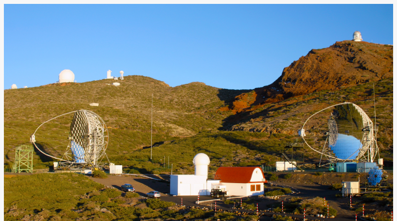
The twin telescope MAGIC at an altitude of over 2200m on the island La Palma