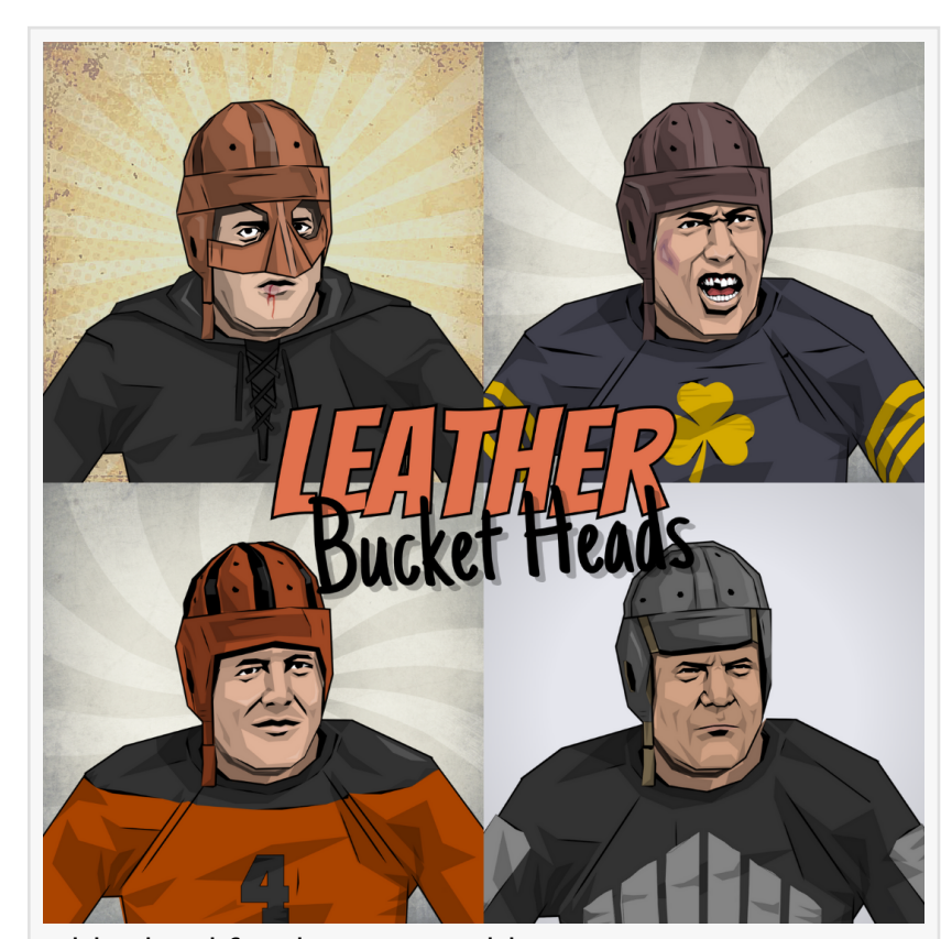
Old school for the new world

Prior to the launch of GM Dynasty, Diversify Games will release a limited series of NFTs called Leather Bucket Heads. The initial drop of Leather