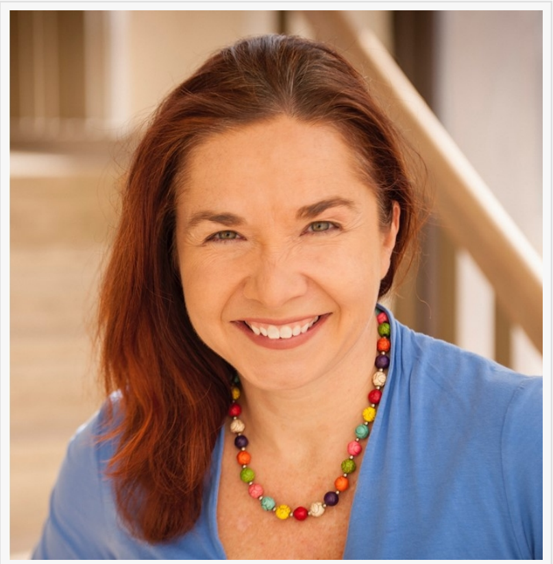
Winner of the AES Energy Writer of the Year, 2021

Saving Us is an accessible, multilayered look at the intersections of science, faith, and human psychology. It offers tools to open dialogue with anyone about how we all can play a role in pushing for change. Drawing on interdisciplinary