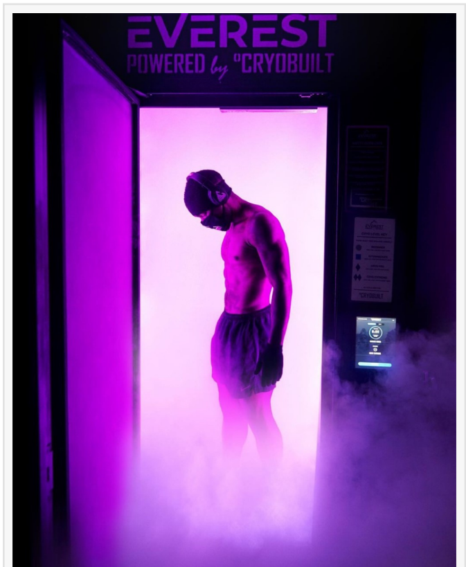
Recover from UFC training in CryoBuilt Cryotherapy chamber

This press release can be viewed online at: https://www.einpresswire.com/article/557010505