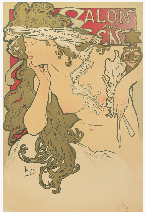
Alphonse Mucha, Salon des Cent / XXme Exposition, 1896. ($43,200).