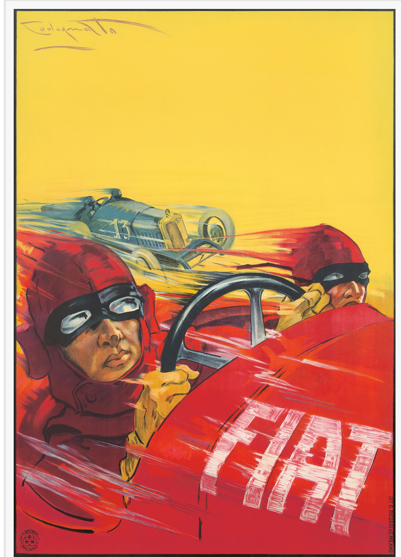
Plinio Codognato, Gran Premio d'Europa / Fiat, 1923. ($90,000).

Celestial bicycle posters captivated collectors at auction. The anonymous ca. 1895 Cycles Gladiator