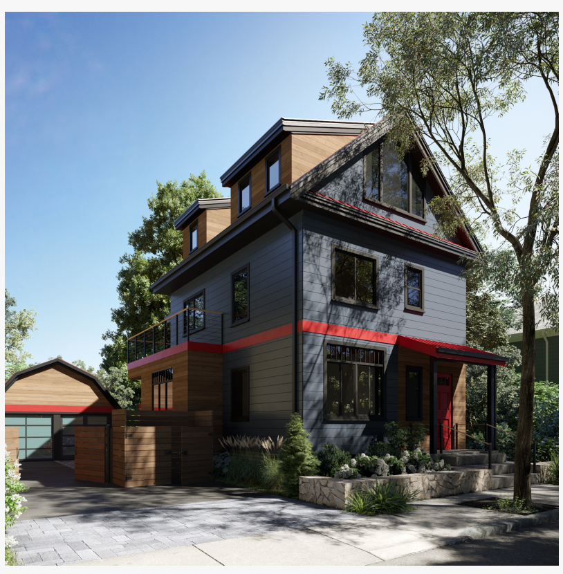
Photo-Realistic Rendering of a Passive House Currently Under Construction