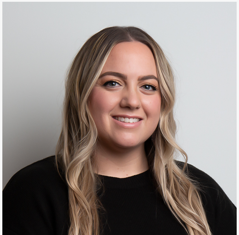
Best Hair Extensions in Louisville KY