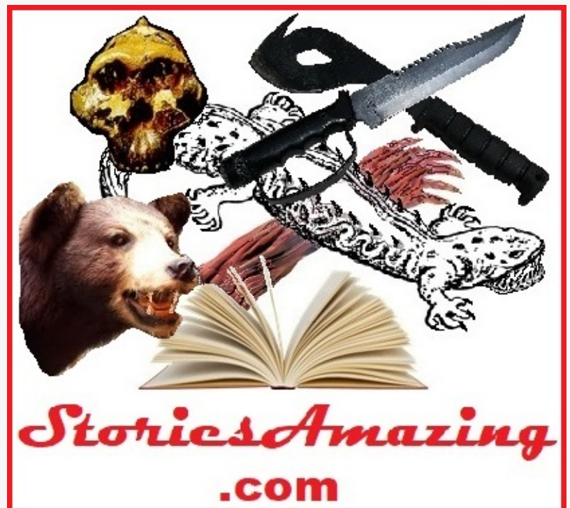
StoriesAmazing Publisher Logo