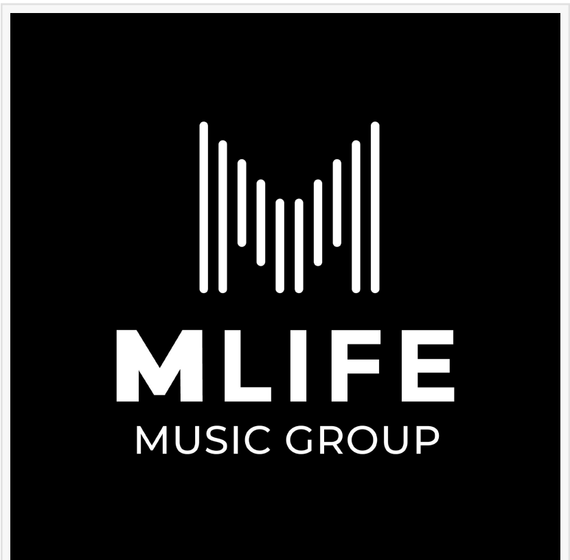
MLife Music Group Logo

The ZmBIZI logo is rendered in a bold, purple, sans-serif font. The letters are thick and blocky, with a slight shadow effect that gives them a three-dimensional appearance. The logo is centered horizontally within a light gray rectangular area.