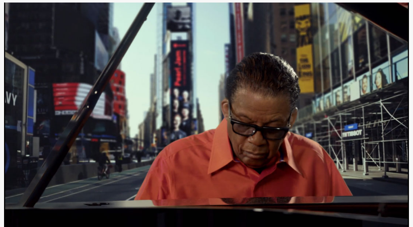
Herbie Hancock is performing "Maiden Voyage"

performed with the underlying theme of "Into a Future Beyond Borders and Generations." This year marks the 20th anniversary of the festival.