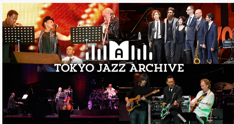
TOKYO JAZZ presents an archive of dream collaborations and other gems

[Special 2: Solo Performance by Herbie Hancock]