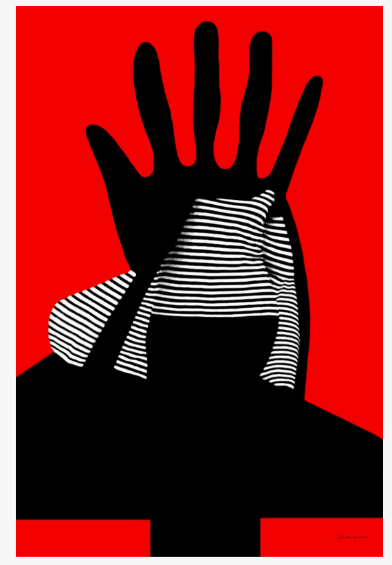
The Control Supervision by Monika Bendner from Germany on Exhibit at Spectrum Miami Booth 503