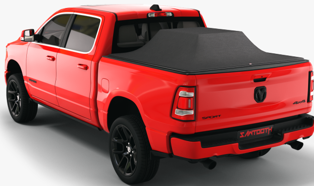
Dodge Ram with a Sawtooth Stretch Tonneau Cover Securing Cargo