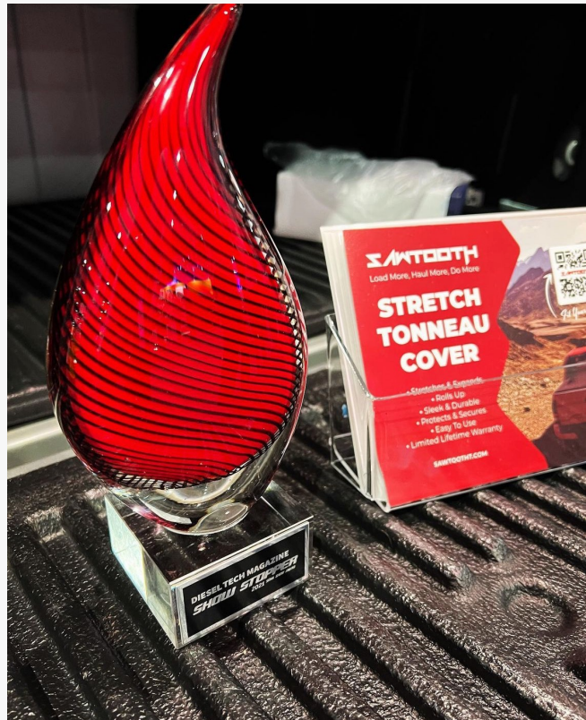
Diesel Tech Sawtooth Tonneau Show Stopper Award