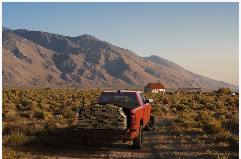
Dodge Ram using a Sawtooth Stretch Tonneau COver to Secure Lumber

About Sawtooth: Sawtooth Tonneau is a top manufacturer of premium, US-made innovative cargo management products that allow users to quickly load, secure, and protect cargo for transit. Sawtooth STRETCH Tonneaus are all about getting more utility out of your truck, so you can load more, haul more, and do more. Whether you're headed to a soccer game or into combat, Sawtooth provides innovative cargo management solutions across multiple modes of transportation.