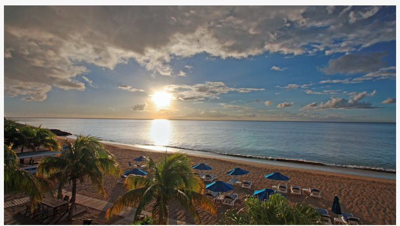
La Plage - Beachfront Condo