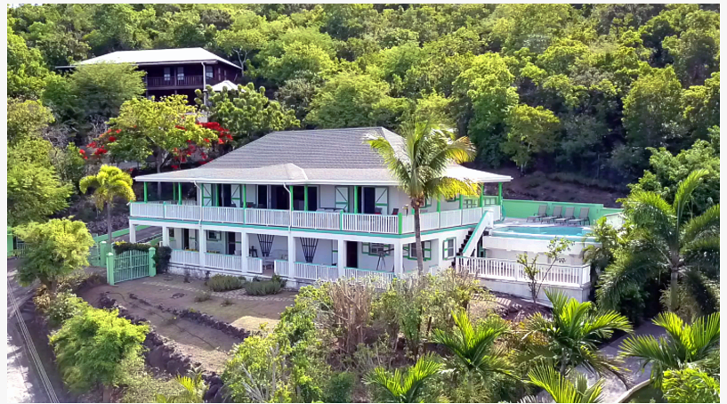
Villa Oasis - Oualie Bay, Nevis

This press release can be viewed online at: https://www.einpresswire.com/article/557228702