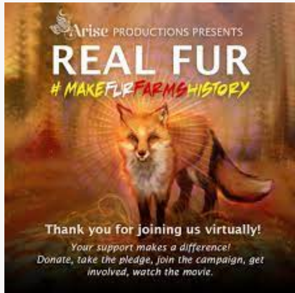
Real Fur: New Documentary Has Consumers Ditching Fur Trim Forever