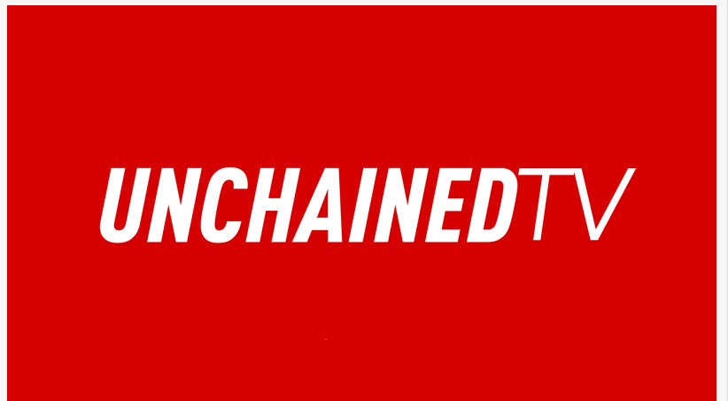
NYC #MakeFurFarmsHistory Protest at Canadian Consulate

On Thanksgiving weekend 2021, hundreds marched to demand governments, specifically the Canadian government, BAN fur farms by enacting a federal law that would make fur farms illegal.