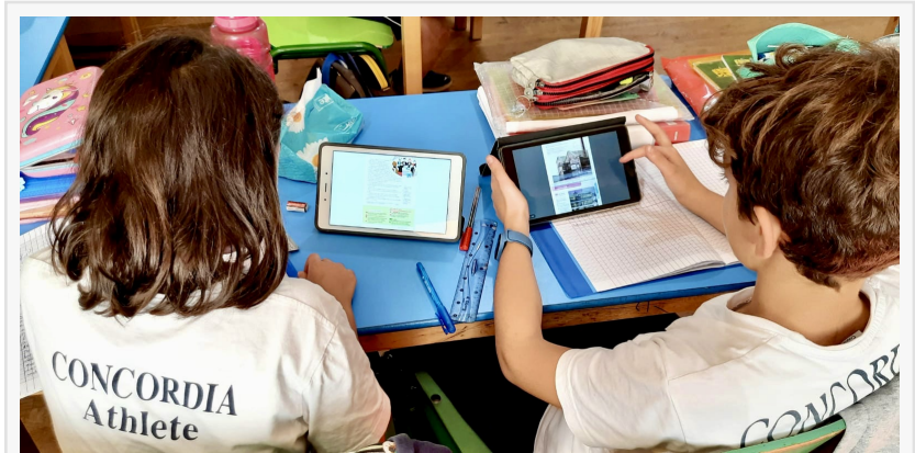
Physical class before class in the metaverse

Students at EBIS and LIFE will enjoy remote classes in more than 50 virtual worlds such as a classroom, an airport, a conference center and a university setting. FluentWorlds has created three specific customized online virtual worlds for the schools in Egypt including a Virtual Farm environment for elementary students and a Virtual Science Laboratory for high school students.