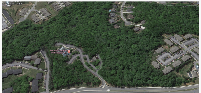
Fall Hill Ave., Fredericksburg, VA 22401