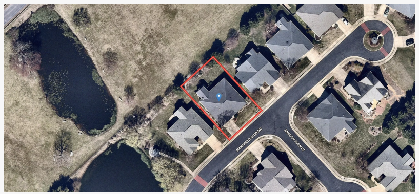
11322 Mansfield Club Dr., Fredericksburg, VA 22408