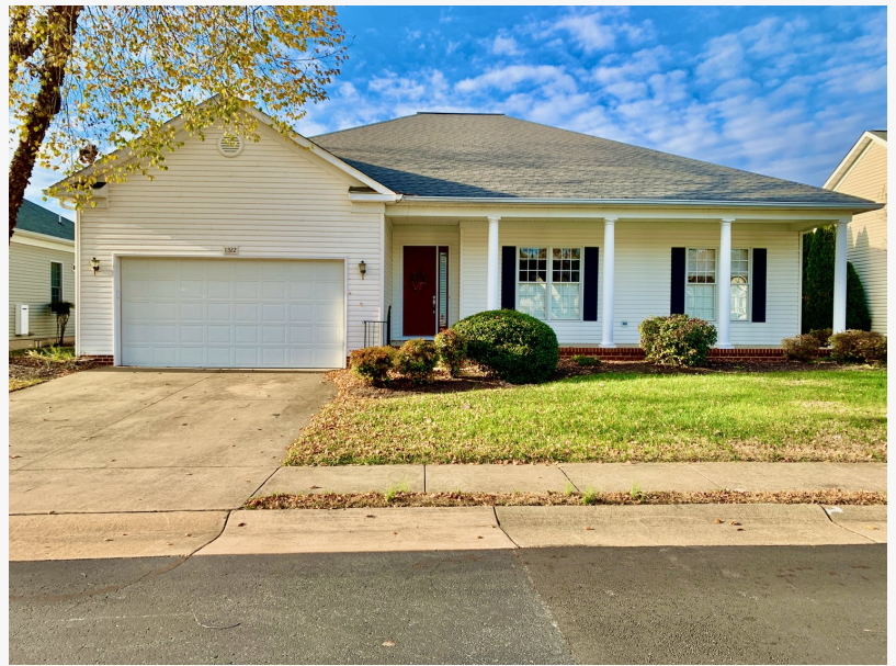
11322 Mansfield Club Dr., Fredericksburg, VA 22408