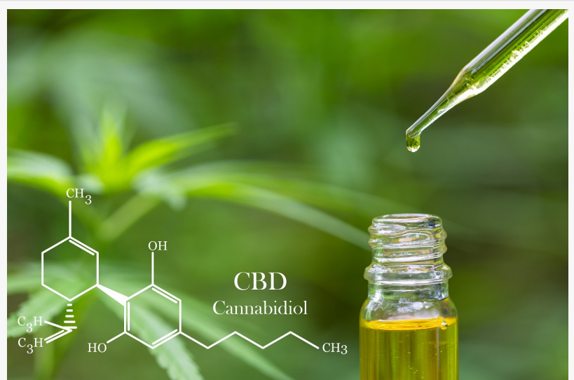
KOR Medical produces high quality cannabinoid and CBD products

KOR Medical has partnered with Leaf411™ to provide free, personalized support to customers, who can speak directly with a cannabis-trained registered nurse on cannabinoid use and applications.