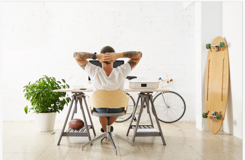
Air Quality Control