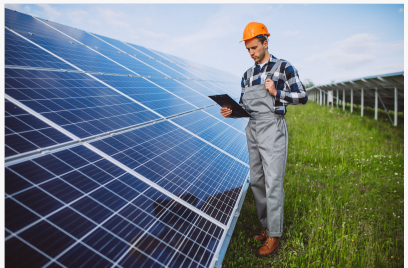
Solar Panels Power Monitoring & Cleaning

Set to transform the IoT industry, Gateway Alpha by iotLINKS is available now from