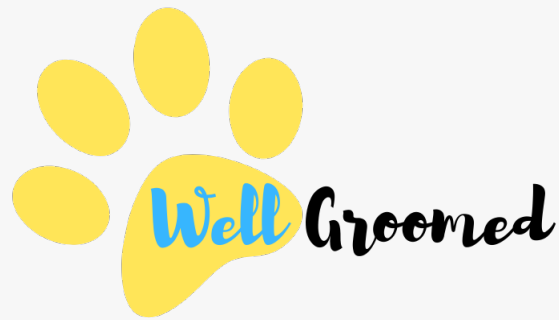
Well Groomed Logo