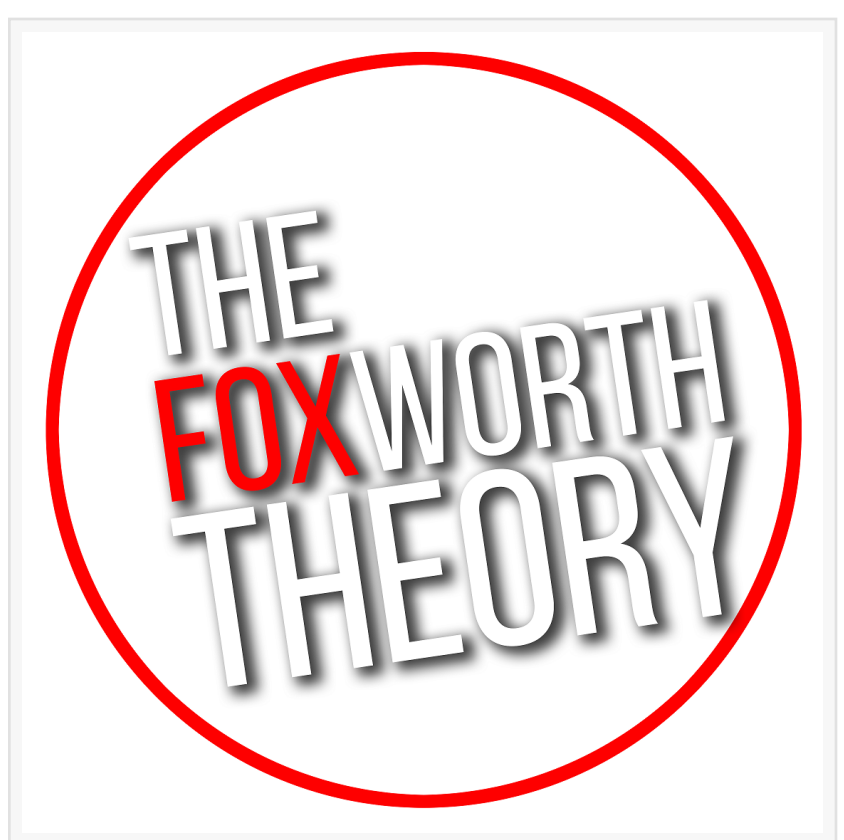
The Foxworth Theory podcast can be seen on YouTube and heard on the VoiceAmerica Variety Channel and the HarlemAmerica Digital Network, Wednesdays at 2 pm ET

This press release can be viewed online at: https://www.einpresswire.com/article/557287365