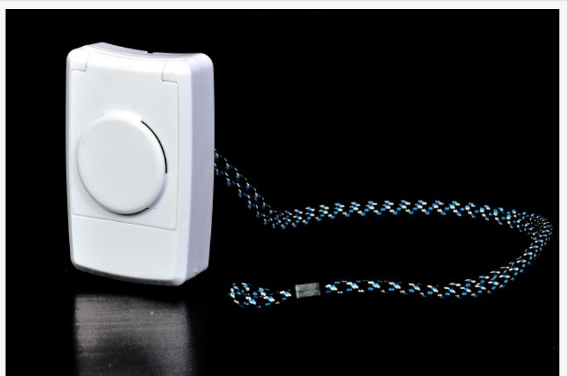
Wearable Device Developed for NASA Eliminates Airborne COVID Virus

Worn as a lanyard or necklace, the Ion SHIELD™ creates an effective 10ft bubble of microbe-killing ions around its wearer. It is lightweight, silent, and odorless. It is powered by a long lasting, rechargeable battery.